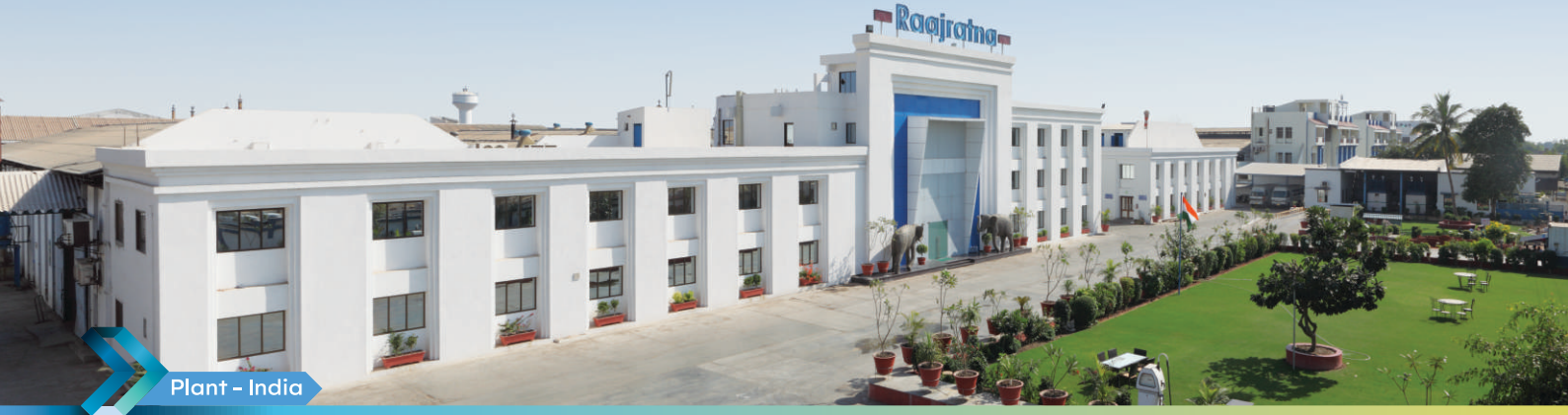
Plant - India