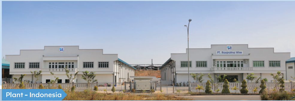
Plant - Indonesia