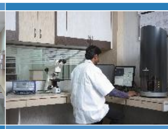
Metallurgical Lab / Conoptica